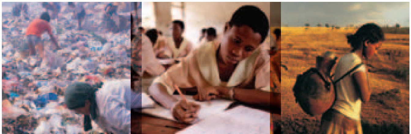
LEFT TO RIGHT: © DIGITAL VISION, © JAMES MARSHALL—CORBIS, © DIGITAL VISION

more than 50 international law instruments were surveyed and summarized in Principles of Environmental Conservation and Sustainable Development: Summary and Survey . 30 Four first-order principles were identified and expressed in the Earth Charter as the community of life, ecological integrity, social and economic justice, and democracy, non-violence, and peace. Sixteen second-order principles expand on these four, and 61 third-order principles elaborate