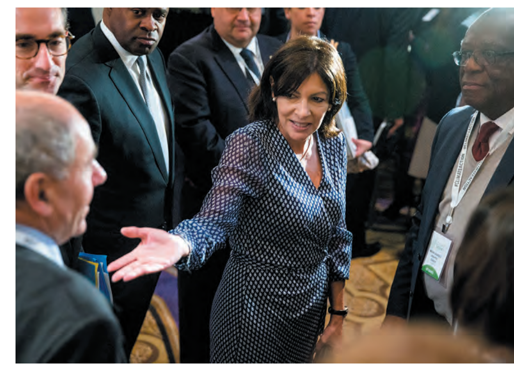
The Mayor of Paris, Anne Hidalgo, at a meeting of the C40 and Compact of Mayors city networks.