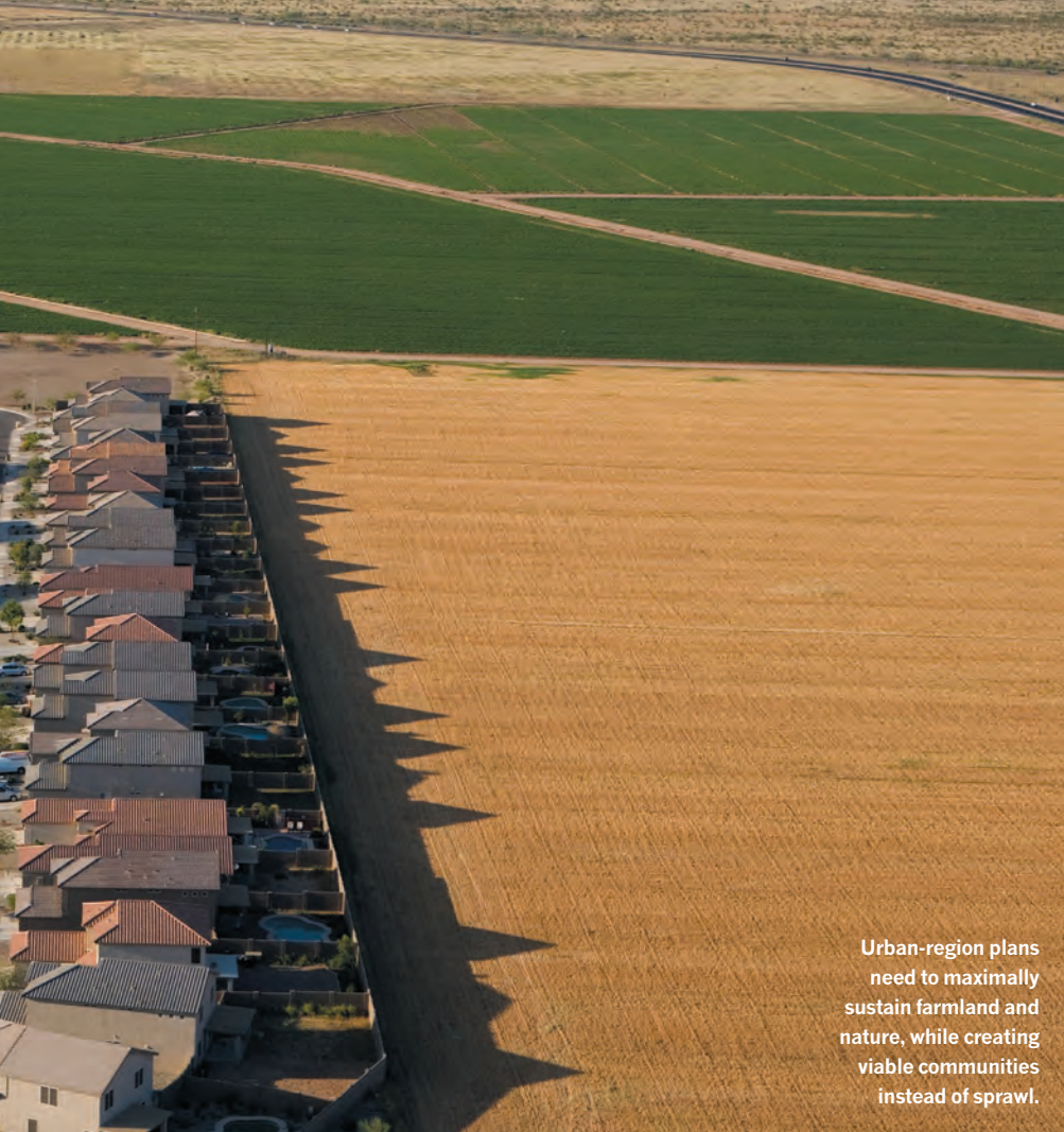
Urban-region plans need to maximally sustain farmland and nature, while creating viable communities instead of sprawl.